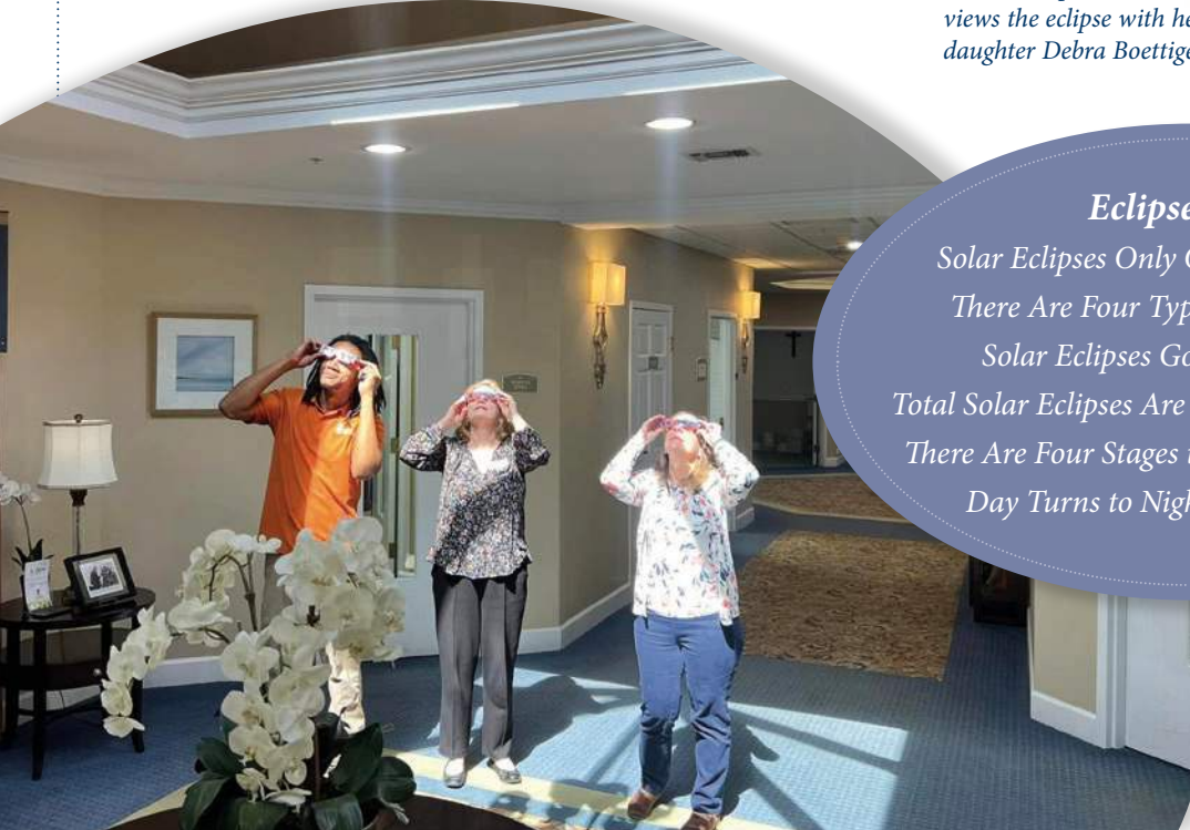
Our Lady team members peek at the eclipse through the lobby's large skylight.